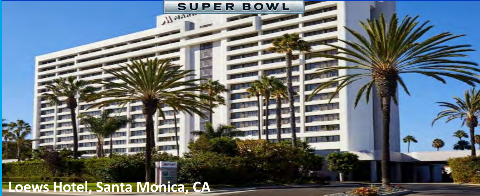
Loews Hotel, Santa Monica, CA